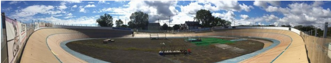
South Chicago Velodrome.

For the past several years Marcus has been involved in the preservation of the South Chicago Velodrome. A Velodrome is an arena for bike racing, typically with steeply banked curves. Chicago at one point was an active center for velodrome racing with 12 tracks some dating back to the 1890s. By the 1920's, bicycle racing was the highest paid sport (Sutherland).